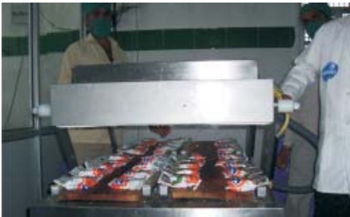
Vacuum Packed Paneer from clean & Quality Milk

milk farmer associations/ societies, formation of a model village to demonstrate clean milk production (CMP) practices, use of bio-gas (non-conventional energy) as a source of energy for dairying and allied activities, providing input services and training to farmers, production of clean and quality milk and providing premium to farmers for the same, manufacture of vacuum packed paneer with extended shelf life, and utilization of whey for production of probiotic whey drink.