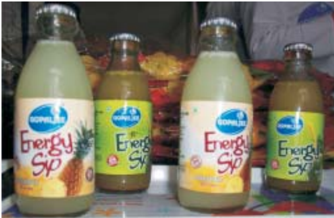
Probiotic Whey Drink in Pineapple & Jal Jeera Flavours