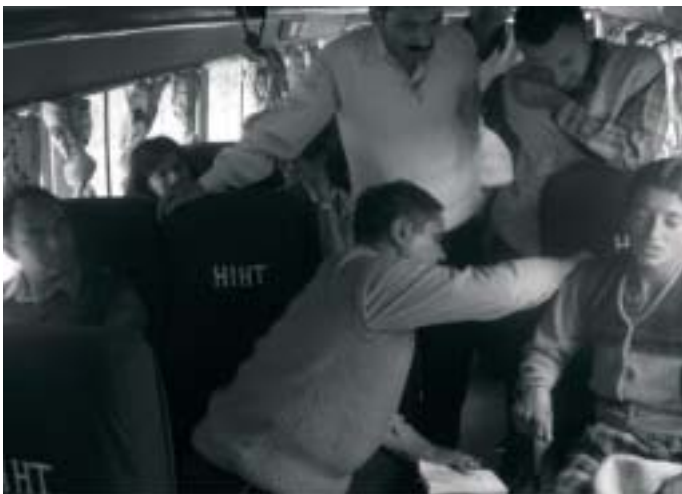
Examining a patient inside the bus during heavy rain

The mobile unit conducted 15 campsite visits on a monthly basis, through which a total of about 17,500 patients benefited during the year. Since the inception of this project in March 2007, a total of about 46,000 patients (nearly 11% BPL) were attended to by this mobile unit. A quick analysis of the diagnosis/treatment data as collected by this unit indicates the prevalence of G.I disorders (20.5%) followed by Respiratory system disorders (16.9%), Dermatoses (12.3%), Musculo skeletal disorders (12%) and Genitourinary system disorders (8.6 %) among the populace. Other diseases diagnosed include metabolic disorders, cardiovascular disorders, anemia and ENT problems. An effective referral mechanism is adopted and patients are referred to nearest Health facilities/ Referral units (Private or Public) for secondary and tertiary care. Subsidized tertiary care at HIHT is assured for the patients. An important point about this project is that the total operating cost of the mobile unit is borne by HIHT, Dehradun.