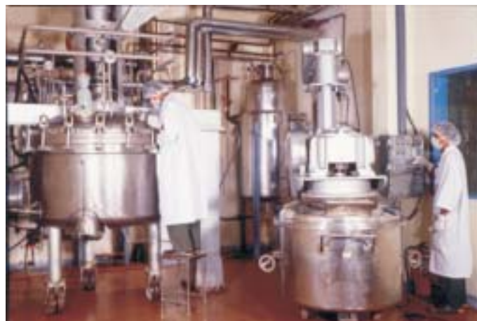
Processing of Bacopa monnieri Liquid Extract

of safety studies in laboratory animals, initiation of clinical trial and development of product promotional material and plans. The project also envisages better value addition by brand building in the international market.