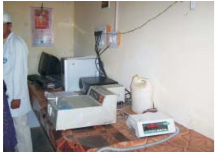
Clean Milk Collection & Procurement Centre Facilities (Bulk Cooler & AMCU unit)

A total of 27 BMCs, with a capacity of 1,000 litres each, were installed and are being used for collection/ procurement of about 40,000 litres/ day of clean and quality milk from 26 villages. The microbial quality of procured milk was found to be improved, as indicated by Methylene Blue Reduction (MBR) time which has increased from less than 30 minutes to 90 minutes.