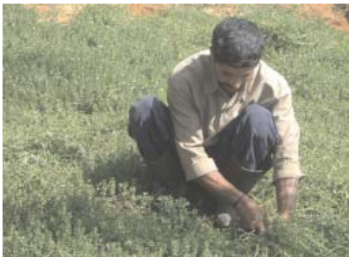
Harvesting Bacopa monnieri (at Natural Remedies Farm)

The activities during the period included purchase of equipment, standardization of plant material, identification of responding bio-assays for bio-activity guided fractionation, optimization of extraction procedure, initiation