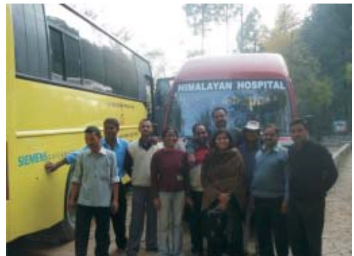
The Mobile Hospital