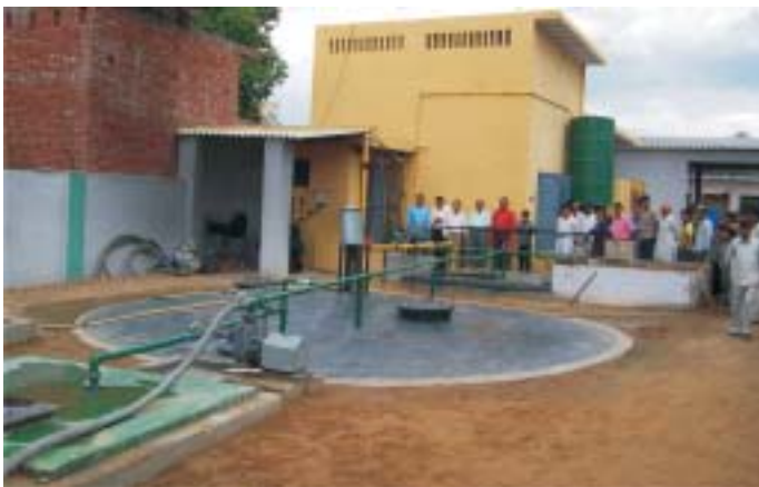
Model Milk Collection Parlor at Bharna run by biogas plant (2TPD capacity)

A bio gas plant of 2-TPD capacity is being operated in the model village Bharna, mainly utilizing cow dung. The power from the bio-gas plant is utilized for operating two milking